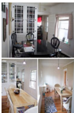
Click for larger pic Dining Room Before & After