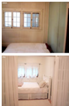
Click for larger pic Bedroom Before & After

Sharon: One project in particular was restoring our two 1920's claw foot tubs. The feet were all rusty and all the fixtures had to be thrown out, but the enamel was still intact! So I made the decision to clean them up. I silver-leafed the outsides as well as added new brushed-nickel faucets, handles and a shower enclosure. This seemed to do the trick, as we have had nothing but compliments on them ever since – not to mention I love the feeling of extreme gratification of accomplishing something that I had thought was impossible to do.