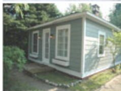
Click for larger pic Cottage Before & After